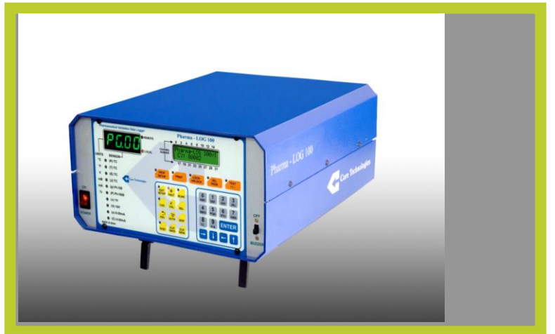
Pharma-LOG 100/16-32 Universal input Data Logger