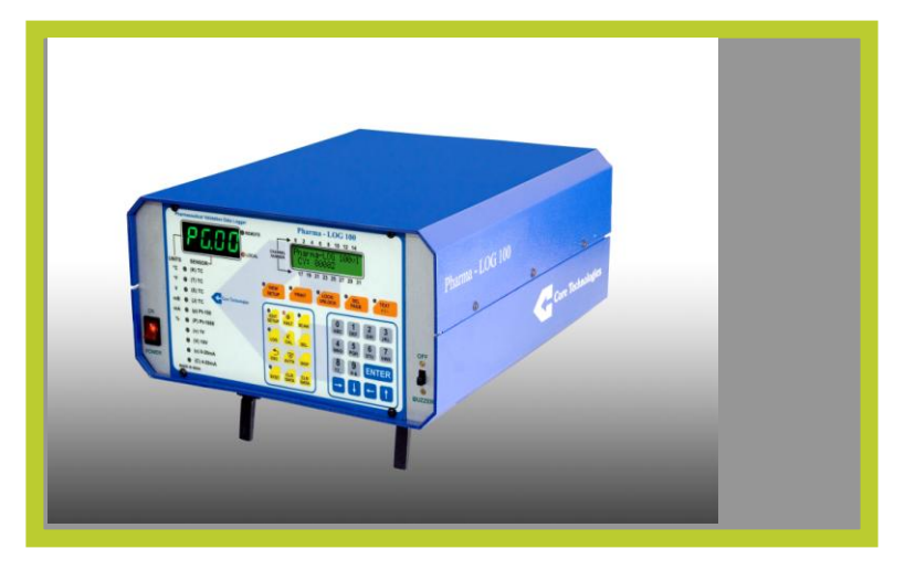
Pharma-LOG 100/16-32 Universal input Data Logger